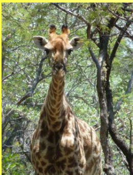
Giraffe picture snapped just before our return to USA